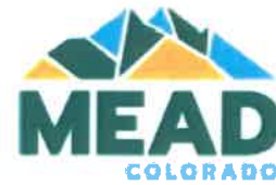
Exhibit A Letter dated February 16, 2022