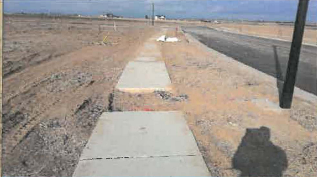
14- Sidewalk panel needs replaced- it was removed for street light install