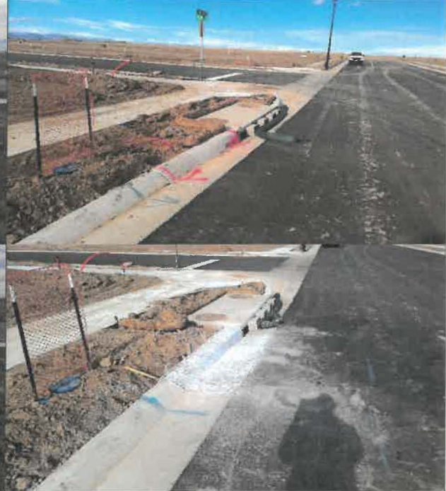
2- R&R @ inlet on west side of road south of Plum St