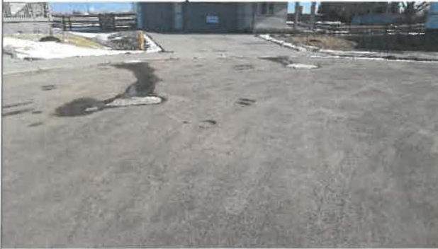
21- Sunrise Place Asphalt