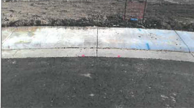
9- Seal crack at end of cul-de-sac