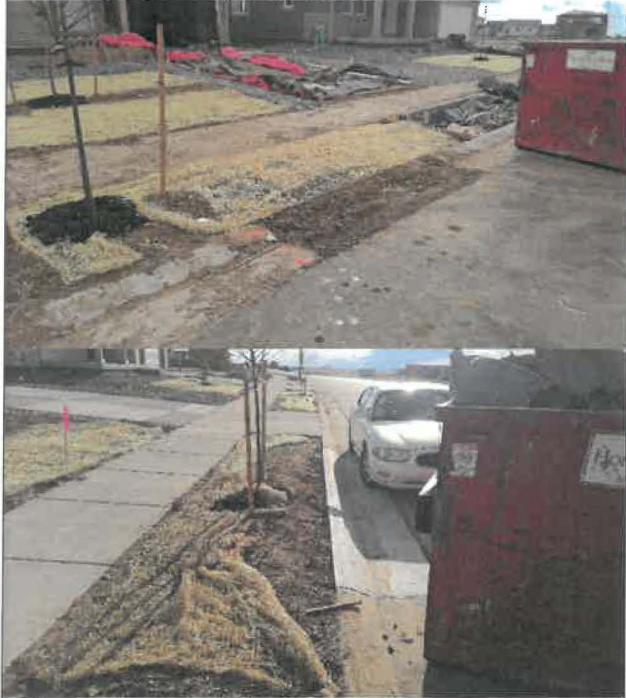
19- C&G missing on Harvest Dr