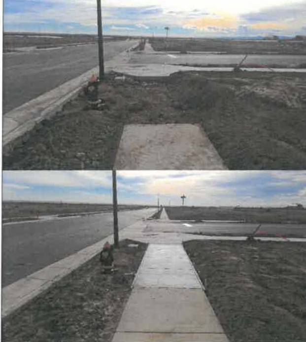
1- Tie-in @ Heritage Dr/Plum St