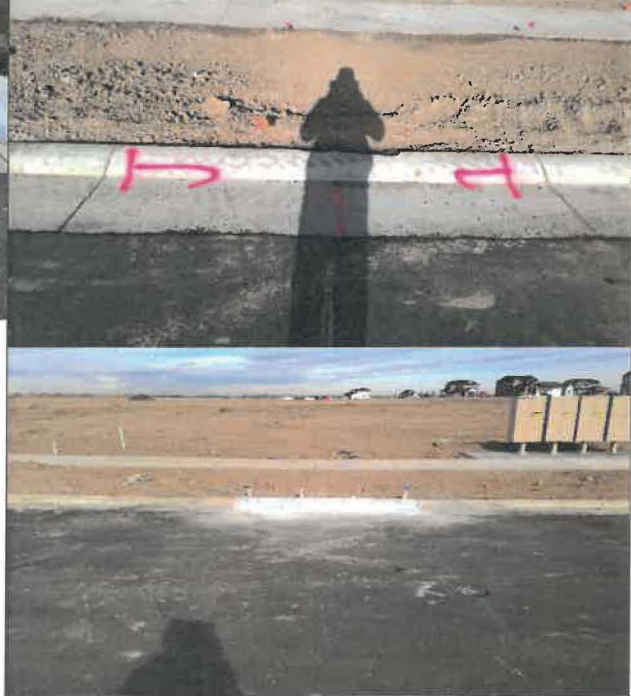
10- R&R c/g on Red Barn Ave (north of intersection with Ranch St)