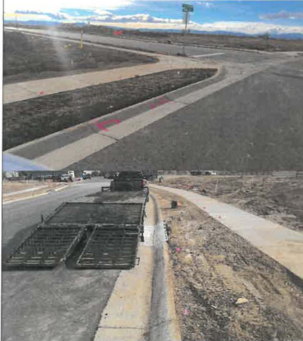
11- R&R c/g on Red Barn Ave (south side, east of intersection with Ranch St)