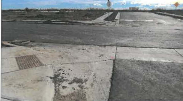
3- Seal Crack in cross pan on north side of intersection