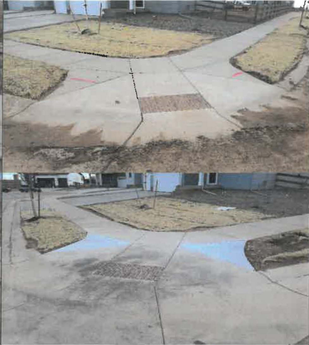
18- 2 panels need replaced on ramp at Harvest Dr/ Sunrise Pl