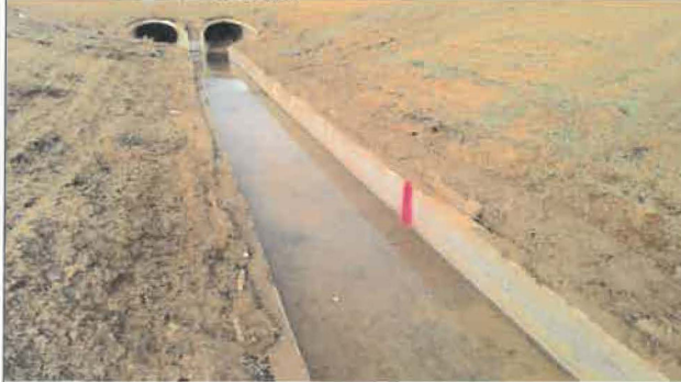
13- Crack needs replaced on trickle channel- roughly 40' south of harvest moon