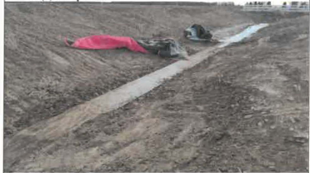
20& 20(a) completed