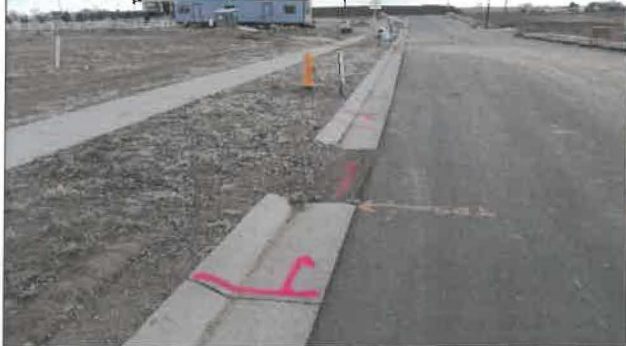
15- C&G missing on Harvest Moon-