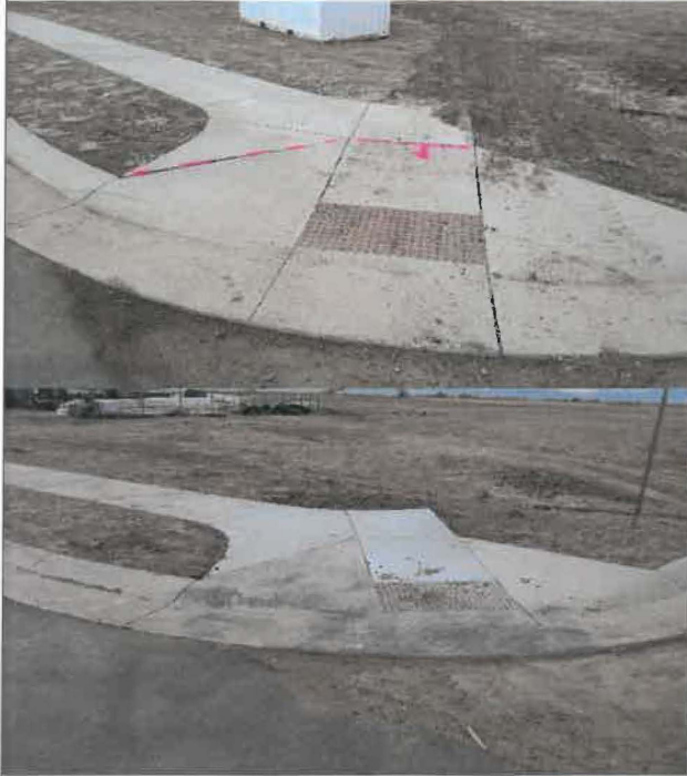
17- Couple panels in ramp need replaced at Harvest/Orchard